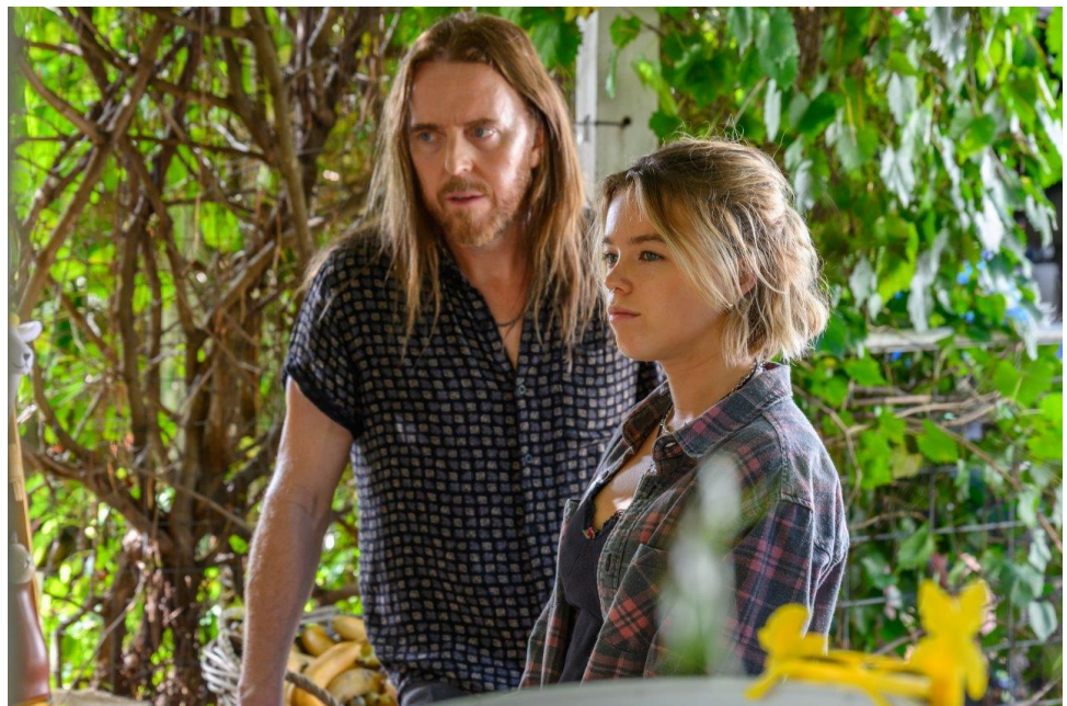
(Tim Minchin as Lucky Finn and Milly Alcock as Meg)

EDMONTON (November 24, 2022) - Super Channel is pleased to announce that season two of the critically acclaimed Australian comedy-drama, Upright , starring celebrated musician, comedian, actor and writer Tim Minchin ( Californication ) and rising global star, Milly Alcock ( House of the Dragon ), will return to Super Channel Fuse on Sunday , December 18 at 9 p.m. ET . Each half-hour episode will be available on Super Channel On Demand the day following its weekly linear broadcast. Super Channel is available via most cable providers across Canada as well as streaming on Amazon Prime Video channels and Apple TV+.