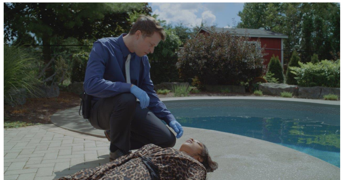
(Love You to Death)

Sunshine Slayings premieres Aug 25 at 8 p.m. ET